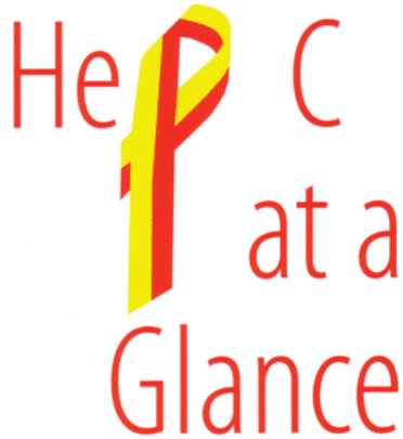
Table of Contents for This Handout Series: